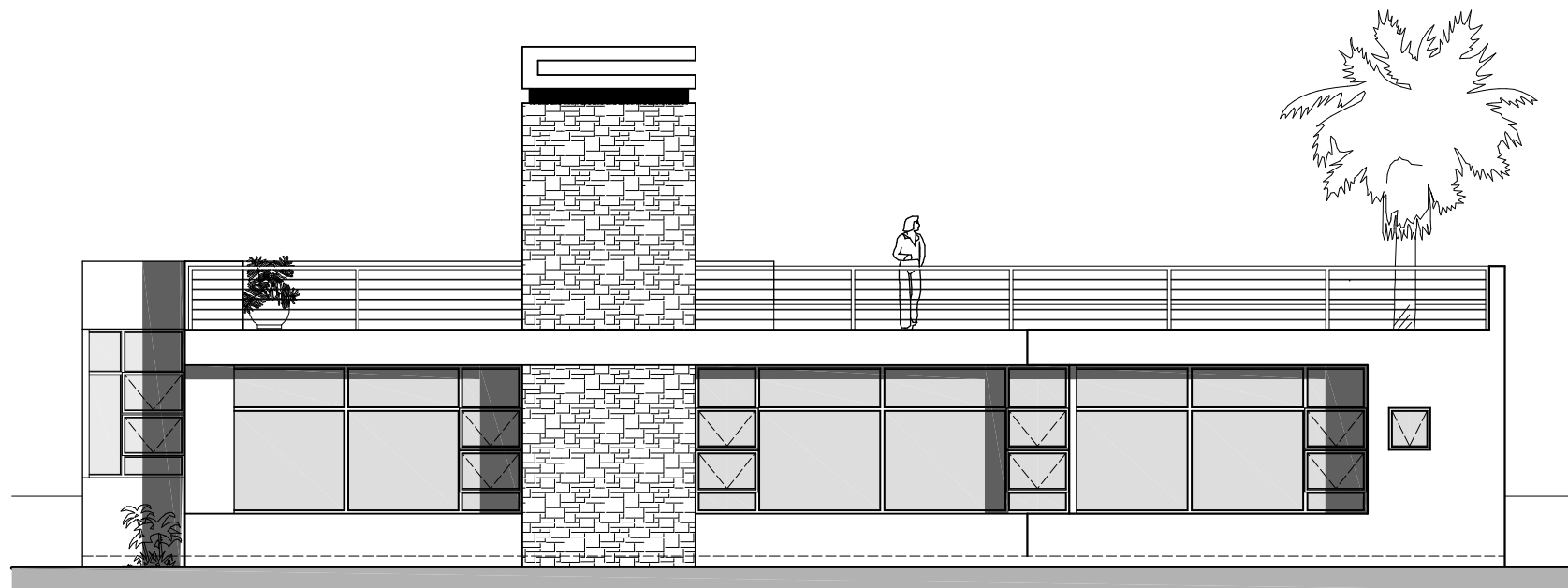
SOUTH-EAST ELEVATION scale 1:100